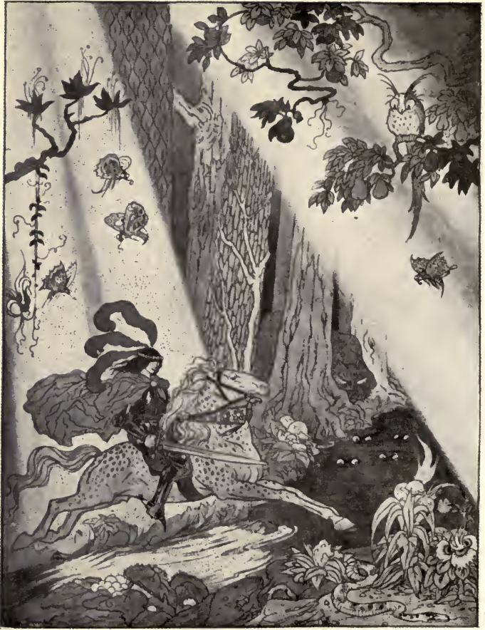
WE WOULD GALLOP THROUGH AFRICA